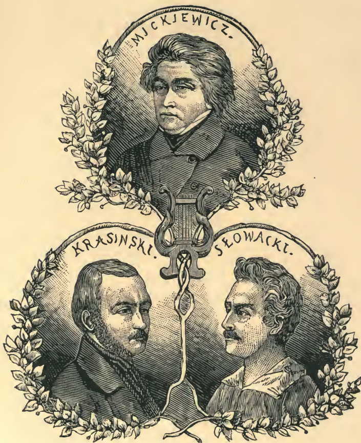
THREE GREATEST POLISH POETS.